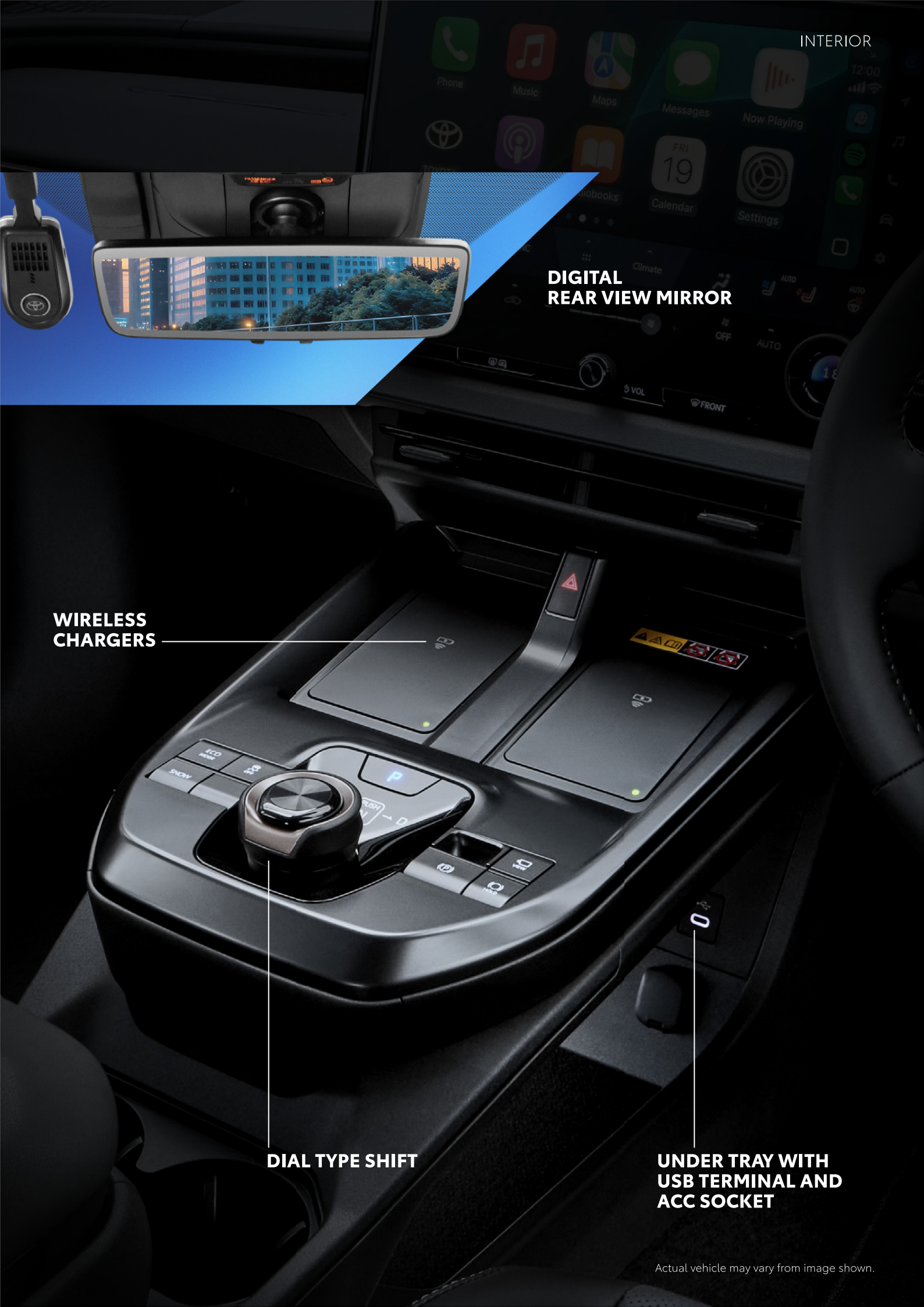
DIGITAL REAR VIEW MIRROR