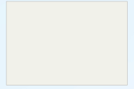
Platinum White Pearl MC. (089)